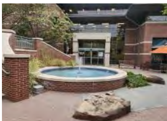
B: Entrance (into Registration Area)