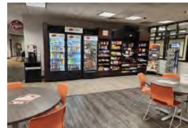
H: Self-Help Kitchen